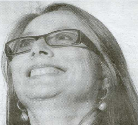
The Visionary » 13